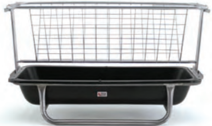
Shown with optional Goat Hay Rack.

This versatile, lightweight feeder is built low to the ground to accommodate goats and all types of short-to-medium sized animals. Extremely durable, this is one of the sturdiest feeders of its kind on the market. It is available with or without the hay rack, which bolts directly to the frame. The hay rack is galvanized for excellent durability and features 4" x 4" wire mesh for easy feeding and minimal waste.