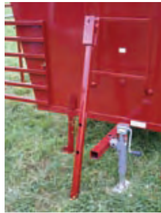
Heavy-duty adjustable tongue is also fully removable