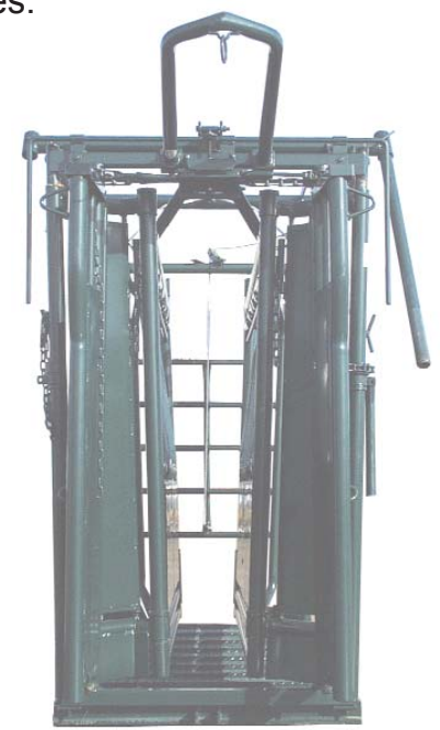
Squeeze sides at minimum width. Headgate swung fully out from squeeze.