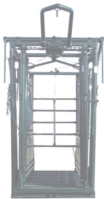
Squeeze sides at full width. Headgate swung fully into squeeze.