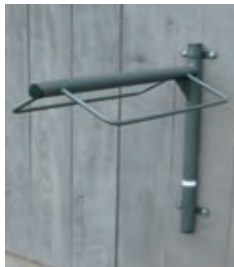
Single Saddle Rack Shelf with Wall Mount SSRWM