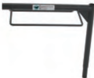
Single Saddle Rack Shelf SSR