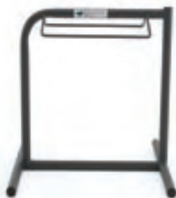
Single Saddle Rack Floor Stand SSRS