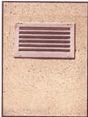
Galvanized or Aluminum Vents