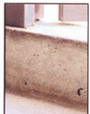
Sump floor contains spills on E Models

Environmental models, (E) - To insure protection against environmental damage and expense caused by spills of hazardous materials, all models are available with a "sump floor" to provide containment. These models are supplied with increased venting to conform to all M.O.E. and M.O.A. recommendations.