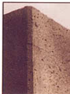
Chamfered Corners for safety