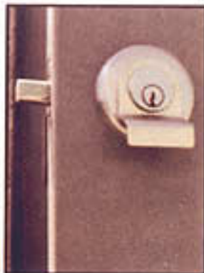
Commercial-keyed Schlage Dead Bolt lock