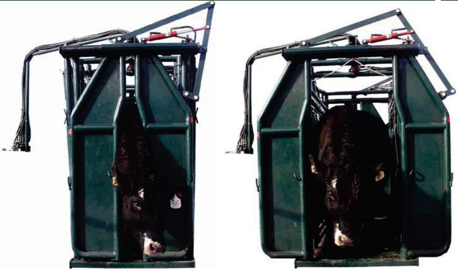
The photo's above show how the squeeze opens to the full width of the squeeze chute for better animal flow.

*This photo was taken before the neck extender was made a standard part of the hydraulic chute.