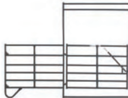
6' Wide Panel & Walk-Thru