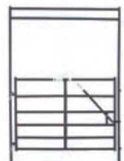
6' Wide Walk-Thru