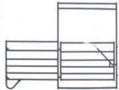
5' Tall Gate & Panel